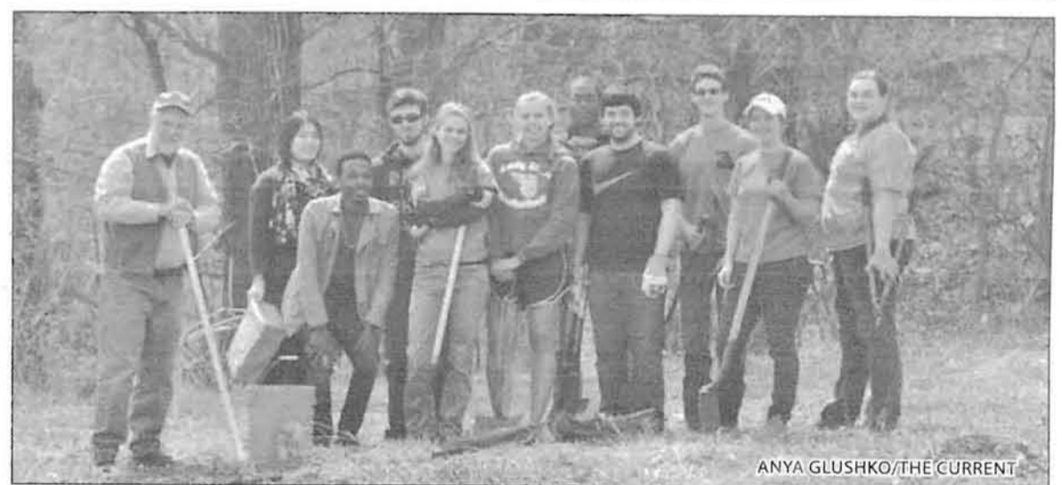
Students gather before beginning the prairie restoration

The expanded course offerings are geared to fulfill the needs of traditional Honors College undergraduate students, upper division biology students, ecology area graduate teachers, and environmental activists in the Missouri Stream Team movement and other conservation organizations. The first course, Great Rivers Ecology, will be offered this summer. Students will study the basics of river and stream ecology during six weeks of online learning. Then they will meet in Louisiana, Missouri for a four-day float trip down the Mississippi River. They will be also conducting