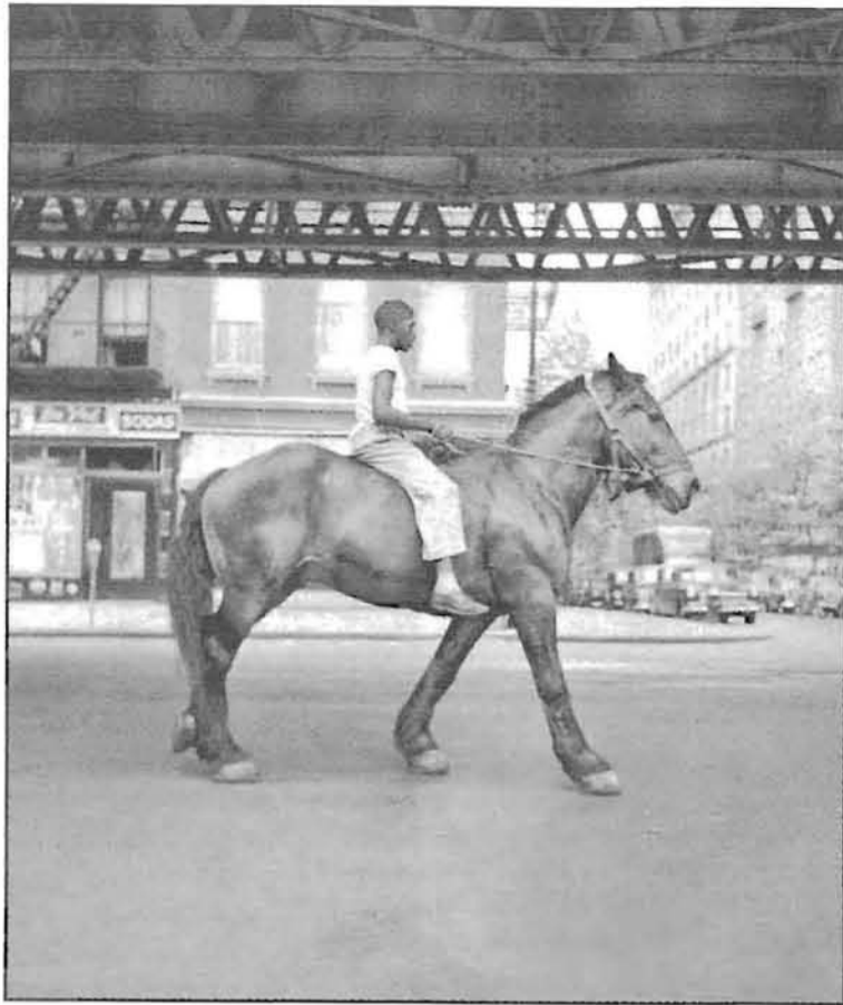
"FINDING VIVIAN MAIER"